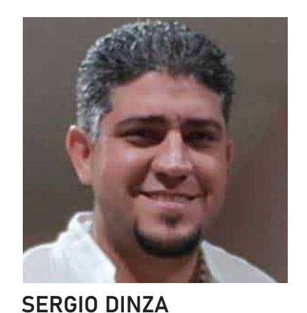
MANAGER Graduated in architecture in 2008. Designer and head of production.