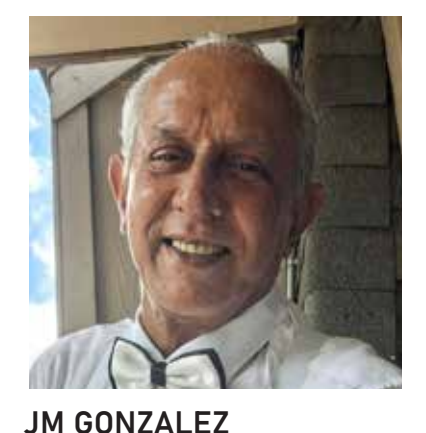
ARCHITECT Architect with more than 35 years of experience in construction and building design.